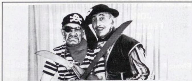
PEDRO THE PIRATE & AWFUL ALEC