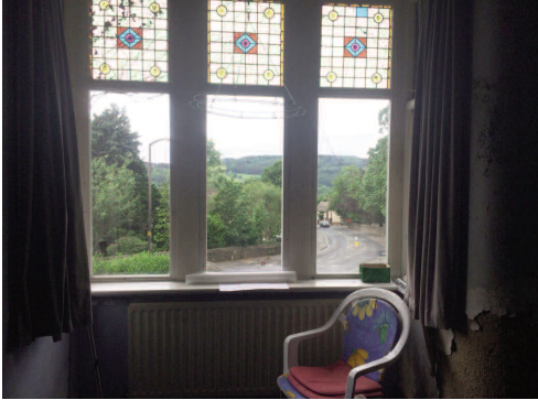
The view down Park Road from the Front Room of the Lodge.

In continuing the story of the Prince of Wales Park Lodge there are lots of questions relating to who, what, when and how? Even before the park was to be declared open in 1865, some opening times had been decided.