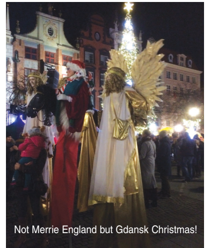
Not Merrie England but Gdansk Christmas!

By contrast, in warmer parts of the world, the people may celebrate in a topsy turvey way. In blazing hot sun tropical clothes for outdoor celebrations there may even include a game of cricket! Maybe no evergreen trees and holly berries, no roast beef, potatoes and peas but a variation on plum pudding with fresh peaches, strawberries and cream. Back to olden days in English customs there was