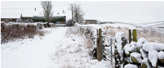
Eldwick in the snow in years gone by.