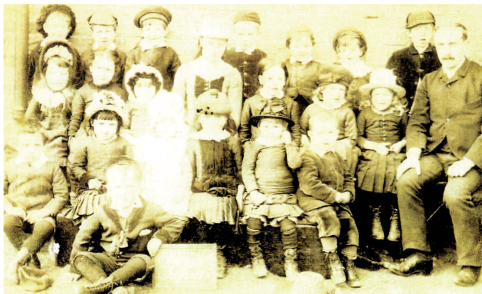
Eldwick Infants – Only two classes were held at Eldwick Board School, one of which was for Infants,