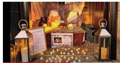
Light Up Nativity 24.12.2020

In other news, we've started a podcast Eldwick Church in the Community . For those who haven't come across podcasts yet, a podcast is a series of spoken word, audio episodes, usually focused on a particular topic or theme. Podcasts are