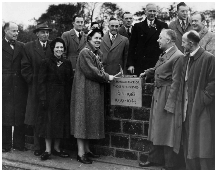
Laying the Foundation Stone

There were continuing developments and expansion following the basic design and provision in the Hall. On the second anniversary of the opening of the Memorial Hall an all-day Bring and Buy Sale was held, principally to raise funds for a domestic hot water supply to the kitchen, partly from the boiler and partly from electricity! Also provision was needed for two cloakrooms. The morning session was opened by the principal of Bingley Teacher Training College. The stage was festooned with flowers and plants donated by the college and 'there was a stress on home produce'. Perhaps this was timely after the October harvest from Eldwick's many orchards and gardens. The members of the thriving Young People's Organisation ran Hoop-La and White Elephant Stalls, and supervised a Fancy Apron Competition. Some of the 'lads' had collected and chopped firewood which was