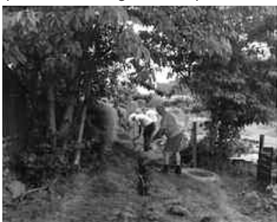
Pictures show: Digging deep - work in progress at the Warren Lane allotments

The grant enabled a small group of allotment holders, through their own endeavours, to extend the water supply across the whole length of the allotments. This involved employing a small mechanical digger to create a 110m-long trench, into which a supply pipe was laid and erecting posts for the eight new taps across its length.