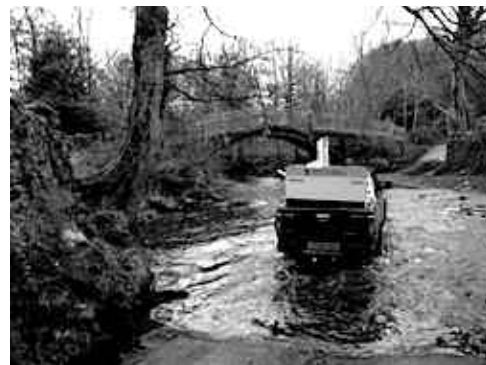
Picture shows: Driver takes an ill-advised short cut to Shipley Golf Club (not one of our members!)

June is a busy month as we plan our stand at the Gala – it will be a good place to meet up with friends and neighbours and to top up your borders from a