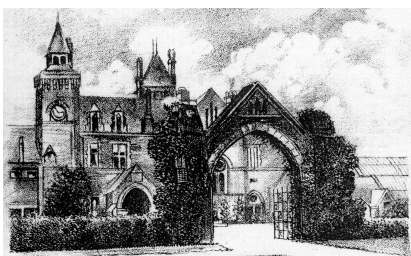
OCT 9TH. 1895.

It was not the only time that Milnerfield was the venue for many community events, either fundraising for charity or treating the workers in the beautiful grounds. The huge conservatory was also the ballroom, as used on October 9th in 1895. Pictured is the invitation card which had a ribbon attached, first to a pencil (made in Austria!), then to the Programme/Engagement Card. This listed each dance, with a dotted line