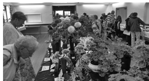
. . . And they've arrived!