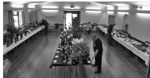
All set up and waiting for the crowds . . .